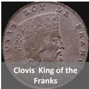
Clovis King of the Franks