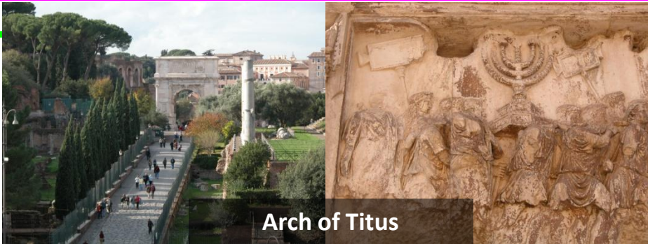
Arch of Titus

Daniel 11:14...also the robbers (Hebrew destroyers) of thy people shall exalt themselves to establish the vision; but they shall fall. Dan 11:16 ...and he shall stand in the glorious land, which by his hand shall be consumed.