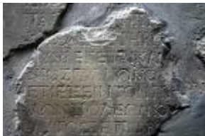
Inscription dating Gallio's proconsulship A. D. 51-52

The stoning of Stephen (Acts 7:58-60) marked the end of the passage in Daniel 9:24 that says: "Seventy weeks are determined upon thy people;" when the gospel spread to the gentiles as mentioned in Acts 8:4: "Therefore they that were scattered abroad went every where preaching the word." Paul was consenting to Stephen's death Acts 8:1. Paul was converted shortly afterwards Acts 9:1-31. To determine this date and the stoning of Stephen we must work back from a well established chronological date found in Acts 18:12 where Paul appeared before Gallio. Gallio's proconsulship can be dated to a short period of A. D. 51-52 on the basis of an inscription found at Delphi which mentions him. Working backwards through the second missionary journey of Acts 16 and 17, we arrive at the spring of A. D. 49 for the beginning of this journey that took Paul to Corinth. This would date the Jerusalem conference of Acts 15 to A. D. 48/49. Since that visit to Jerusalem is the one "after fourteen years" in Galatians 2:1 projecting backwards we come to A. D. 35/36. Galatians 1:18 speaks of the remaining three years further back to 34 A. D. This proves beyond doubt the historical authenticity of the 70 weeks prophecy shown in these 4 charts.