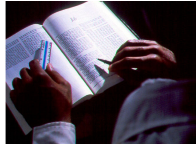
We must test everything by the Bible – seeing is NOT believing.