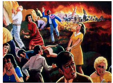
Many who claim to be followers of Christ will be told, "I never knew you".

Here we see deceived people. They have preached – even in the name of Jesus. They have performed the miracle of casting out devils. (This is not Satan casting out Satan but a deception of it). They have also done many wonderful works; which surely includes works of healings, yet in the end Christ says to them "I never knew you". What a horror – to discover too late that you are on the wrong side – deceived by Satan – eternally lost.