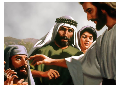
Jesus worked many miracles during His ministry on earth.

People were miraculously healed in Bible days, but is it reasonable to assume that gifts of healing are available now? The Bible promise is still there! Without doubt many of the marvelous advances in medical science, have resulted from the enlightenment by the Holy Spirit of godly doctors, nurses, dieticians, research chemists, and others who have dedicated