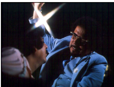
Many Charismatic “healers” are frauds – taking advantage of vulnerable people.