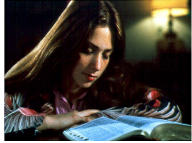
A simple faith, trusting in God's word, will save the need for "exciting deceptions".

When Christ left earth, Satan immediately began to counterfeit His works. Records of the centuries are full of counterfeit miracles, many a part of church lore. We can be sure that Satan will counterfeit miracles toward the end of time. Genuine miracles and healings will certainly occur too. How can we tell the difference? Only by having our faith firmly embedded in the Word of God. When we know the truth it will make us free and deception will not overtake us. The belief that excuses or neglects the law of God is a great deception. Beware of miracle working power that excuses disobedience to God's law. Beware of pretended holiness that permits transgression. It is gross error. A faith built largely on emotionalism rather than reason will lead to the path of error. A faith that seeks its authentication in miracles rather than a "Thus saith the Lord" will lead to deception. A faith that bases its every belief on the Bible will lead to the Kingdom of God. Upon what do you base your faith?