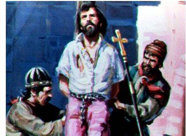
As in the Dark Ages, this persecuting power will persecute God's people again.

Daniel 8:23-25 And in the latter time of their kingdom, when the transgressors have reached their fullness, A KING SHALL ARISE, HAVING FIERCE FEATURES, WHO UNDERSTANDS SINISTER SCHEMES. HIS POWER SHALL BE MIGHTY , but not by his own power; he shall destroy fearfully, and shall prosper and thrive; HE SHALL DESTROY THE MIGHTY, AND ALSO THE HOLY PEOPLE . Through his cunning he shall cause deceit to prosper under his rule; and he shall exalt himself in his heart. He shall destroy many in their prosperity. HE SHALL EVEN RISE AGAINST THE PRINCE OF PRINCES ; but he shall be broken without human means.