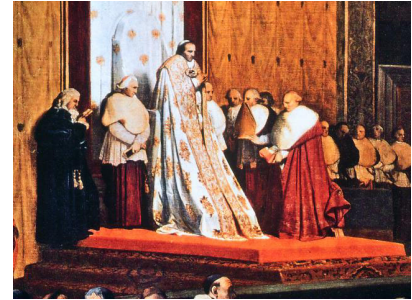
The Papacy is the Little Horn of Daniel Eight.

Rome and Rome only fits this historical picture. Without doubt it is the “little horn” of Daniel 8.