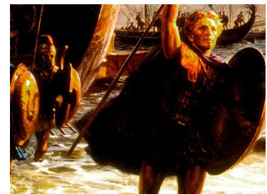
The Goat symbolized the conquest of Greece.

And as I was considering, suddenly A MALE GOAT CAME FROM THE WEST, across the surface of the whole earth, without touching the ground; and the goat had a NOTABLE HORN BETWEEN HIS EYES. Then he came to the ram that had two horns, which I had seen standing beside the river, and ran at him with furious power. And I SAW HIM CONFRONTING THE RAM; he was moved with rage against him, ATTACKED THE RAM, AND BROKE HIS TWO HORNS. There was no power in the ram to withstand him, but he cast him down to the ground and trampled him; and there was no one that could deliver the ram from his hand.