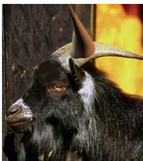
A little horn arose out of one of the four horns.

Some have mistaken the little horn to be Antiochus Epiphanes, king of Syria who was a great enemy and persecutor of the Jews. But as we will see, it cannot be so, because he does not fit into the details of the prophecy.