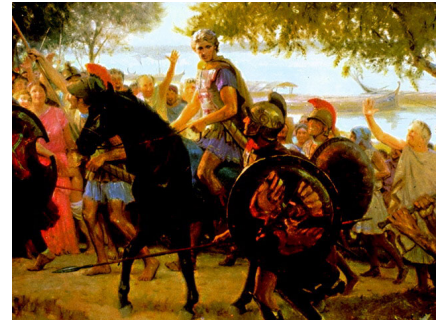
Large horn on Goat symbolized Alexander the Great.

Here is emphasized the sudden fall of Alexander. He was the large horn that was broken. This mighty warrior died at the age of thirty-three, partly because of his overexertions in conquering the world, and partly from a fever caused by his intemperate living. After a drunken debauch he was seized with a violent fever and died eleven days later, June 13, 323 B.C. Before he died he was asked who should rule the kingdom. His reply was “let it go to the strongest!” Alexander’s brother and two infant sons were declared rulers of the empire, but they were soon murdered and the family of Alexander became extinct. Thus there were twenty years of strife between the generals of Alexander as they struggled for the supremacy. Ultimately the empire was divided into four kingdoms, paralleling the four notable horns. Macedonia was ruled by Cassander, Thrace and Asia Minor by Lysimachus, Syria by Seleucus and Egypt by Ptolemy.