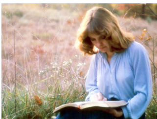
Walk in the light while you have it.

The person who has such a conscience is past feeling – past response to the conviction of the Holy Spirit. A seared conscience has no feeling, it is like a dead radio. Radio waves may be all around but the dead radio cannot detect them. Some minds have developed this way so that they can no longer hear the pleading voice of God. There is no desire to repent, no desire to follow truth. Such a person has indeed committed the unpardonable sin. The fact that a person is concerned shows that they are not guilty, for those who are guilty are in no way concerned. The one who is somewhat fearful gives evidence that he can feel the Holy Spirit convicting him: thus he has not committed the unpardonable sin.