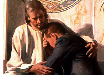
If we confess our sins – all is forgiven.

Ephesians 4:30 And DO NOT GRIEVE THE HOLY SPIRIT OF GOD, by whom you were sealed for the day of redemption.