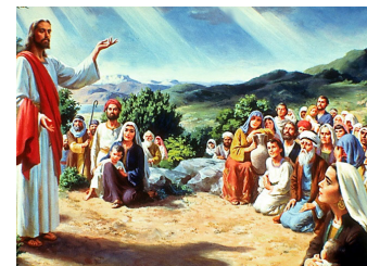
Jesus taught that it is unpardonable to speak against the Holy Spirit.

Here is the unpardonable sin – speaking against the Holy Spirit. There has been a great deal of speculation as to what the unpardonable sin actually is. Some have said that it is murder; others say adultery or rape; but this cannot be. Notice Jesus said, “all manner of sin shall be forgiven” and this means any sin you would care to name. King David was forgiven for murder and adultery. Rahab was forgiven when she turned from her life of harlotry. Peter was forgiven for his denial of Christ. Mary Magdalene was forgiven for her licentious ways and Moses was forgiven for killing the Egyptian.