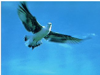
We can grieve the Holy Spirit by continual rejection of conscience.

John 16:13 However, when He, the Spirit of truth, has come, HE WILL GUIDE YOU INTO ALL TRUTH; for He will not speak on His own authority , but whatever He hears He will speak; and He will tell you things to come.