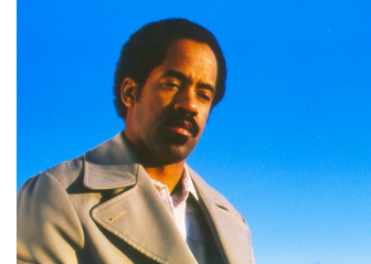
The more we resist, the weaker the Spirit’s voice is to our minds.

Isaiah 30:21 YOUR EARS SHALL HEAR A WORD BEHIND YOU, SAYING, “THIS IS THE WAY, WALK IN IT,” Whenever you turn to the right hand or whenever you turn to the left.