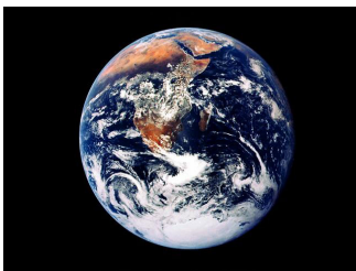
What use is it if we gain the whole world but lose our soul because we resist God’s leading?

James 4:14,17 Whereas you do not know what will happen tomorrow. For WHAT IS YOUR LIFE? IT IS EVEN A VAPOR that appears for a little time and then vanishes away. Therefore, to him who knows to do good and does not do it , to him it is sin.