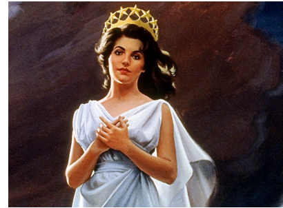
Church depicted as a woman in Revelation 12.

Hebrews 10:25 Not forsaking the assembling of ourselves together, as is the manner of some, but exhorting one another , and so much the more as you see the Day approaching.