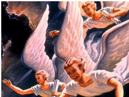
God is calling people out of false systems of worship to unite with God’s remnant church

Revelation 18:2, 4 And he cried mightily with a loud voice, saying, “Babylon the great is fallen, is fallen, and has become a dwelling place of demons, a prison for every foul spirit, and a cage for every unclean and hated bird!” And I heard another voice from heaven saying, “Come out of her, my people, lest you share in her sins, and lest you receive of her plagues.”