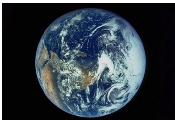
Church called to preach the gospel to the whole world.

Matthew 24:14 And this gospel of the kingdom will be preached in all the world as a witness to all the nations, and then the end will come.