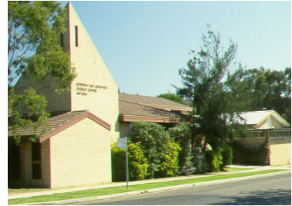
The church has the responsibility of dealing with sin in the church.

Ephesians 5:25-27 Husbands, love your wives, just as Christ also loved the church and gave Himself for her, that He might sanctify and cleanse her with the washing of water by the word, that He might present her to Himself a glorious church, not having spot or wrinkle or any such thing, but that she should be holy and without blemish.