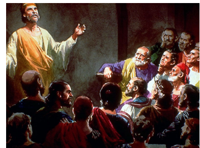
Elders were appointed in every church.

Acts 2:47 Praising God and having favor with all the people. And the Lord added to the church daily those who were being saved.