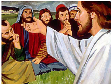
Jesus told parables concerning the church.

In Matthew 13:37-43 Jesus explains this parable. He said that the good seed was sown by the Son of man and the field is the world. The good seed are Christians and the tares belong to the devil. The harvest is the judgment at the end of the world. Both good and bad live in this same world, but we should not even be surprised to see both good and bad in the church. Some are offended when they see professed Christians acting or speaking in a manner not in accord with Christian standards. Don’t be dismayed for it is the devil’s plan to use such people to turn you away from the church and thus cause you to be lost. We must always look to Jesus for our example – not people. However it is not our prerogative to condemn people and set ourselves up as judges – that would be wrong. But we quietly observe, and resolve to live the life God wants us to live. We are responsible to God for our own lives. If we could tactfully help another person who is harassed by temptation, that is a different matter.