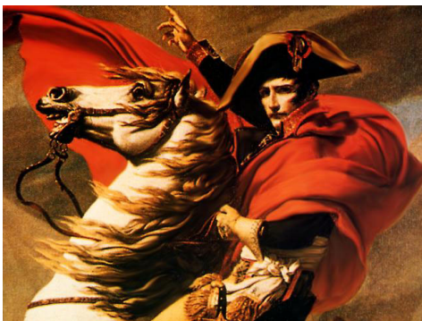
Napoleons General, Berthia took the Pope prisoner in February of 1798.

The wounding of the head was fulfilled in 1798 when Berthia at the head of the French Army, declared the political rule of the Papacy at an end, and took the Pope prisoner to France. However, “the deadly wound was healed”, for in 1929 the Lateran Treaty restored temporal power to the Pope, who was given the rule of the Vatican City. The prophet saw a much greater restoration when the wound was completely healed. Following the healing all but a faithful few would worship the beast. This is still future. The mouth speaking great things and 42 months parallels Daniel 7, when Rome oppressed the people of God during the dark ages.