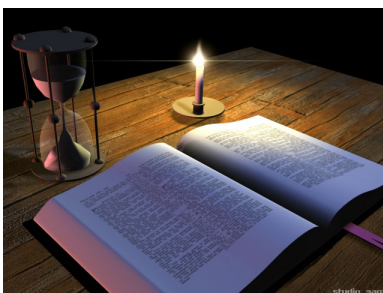
The Catholic Church states that its tradition is equal to the Word of God.

Protestants likewise recognize that this change rests solely upon the authority of the church . They recognize that there is no divine command for Sunday . “The observance of the Lord’s day (Sunday) is founded not on any command of God, but on the authority of the church” – ‘ Augsburg Confession of Faith ’, quoted in ‘ Catholic Sabbath Manual ’, part 2, chapter 1, and section 10.