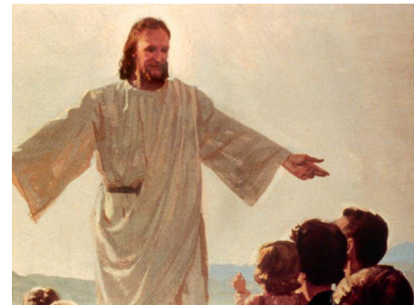
Jesus will stand up for His people.

To keep the Sabbath is a sign that we give our allegiance to God and not to man. The issue is not over whether one day is any better than another, but it is what the day stands for that counts. Sunday observance is a “mark” of the church’s power, but the Sabbath is a “sign” of Christ’s power. If a man stamped on a piece of red, white and blue cloth nobody would be over-concerned. But if that red, white and blue cloth were the Australian flag, patriotic Australians would take very strong exception. It is not the cloth – but what it stands for. The Sabbath is Christ’s holy day, but Sunday is man’s substitute. Depending on which day you keep, shows whose side you are on. It is a matter of allegiance, not just a day.