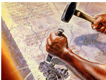
The Catholic Church claimed the power to change the day of worship from Sabbath to Sunday.

The prophecy states that the little horn power would intend or think to change the law of God. In