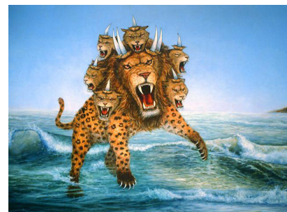
The beast of Revelation 13.

Revelation 13:1-2 Then I stood on the sand of the sea. And I saw a beast rising up out of the sea, having seven heads and ten horns, and on his horns ten crowns, and on his heads a blasphemous name. Now the beast which I saw was like a leopard, his feet were like the feet of a bear, and his mouth like the mouth of a lion. The dragon gave him his power, his throne, and great authority.