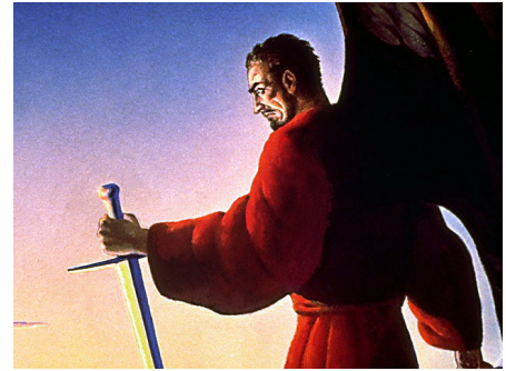
Satan works through men and governments to destroy God’s people.

Here we notice that the beast persecutes the true followers of Christ and requires the inhabitants of the earth to worship him. The “dragon” in chapter 12, as standing before the woman about to give birth to the child precedes this beast power. This child is none other than Jesus Christ (see study 25 – The True Church ). Primarily the dragon represents the devil. Rev.12:9. However, Satan works behind the scenes, using men and governments to pursue his acts of hatred against Christ and His truth. What earthly government did Satan use in his attempts to destroy Jesus? A Roman governor sought to destroy Him at his birth, and a Roman ruler sentenced Him to death on the cross. The dragon which gave its “authority” (Rev. 13:2) to the religious power that had the “mark” was none other than “pagan Rome.” Now, what power acting in the realm of religion received from pagan Rome it’s “seat and great authority”? The historian states, “out of the ruins of political Rome arose the great moral empire in the “giant form” of the Roman church.” ( The Rise of the Medieval Church , page 150, A.C. Flick.)