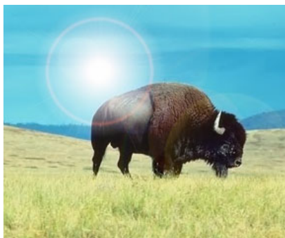
Two horned beast that came out of the earth.