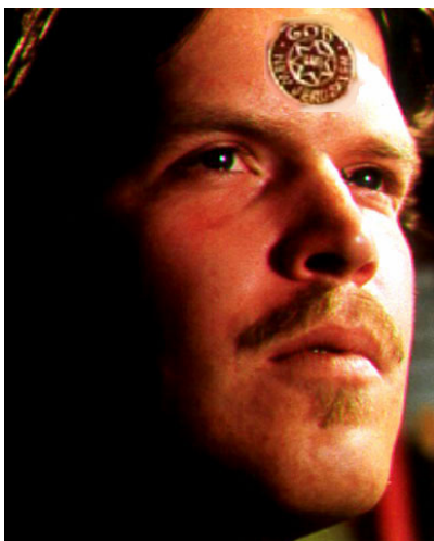
God’s people are sealed by keeping all of God’s commandments.

Exodus 31:16,17 Therefore the children of Israel shall keep the Sabbath, to observe the Sabbath throughout their generations as a perpetual covenant. It is a sign between Me and the children of Israel forever; for in six days the LORD made the heavens and the earth, and on the seventh day He rested and was refreshed.