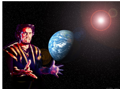
Satan will seek to force the whole world to break God's commandments.