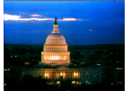
America will make a law enforcing Sunday Worship.

Here are God’s people receiving the “seal of God” before the four winds are let loose on the earth (winds represent strife). These have God’s “mark” of authority upon them. They are His property. In 1 Kings 21:8 we have an example of a king’s seal, which gave the documents proper authorisation. Here in Revelation 7 we see God claim His own children. The “Mark of the Beast” can be received in the forehead or the hand. When we understand the Sabbath-Sunday issue, it becomes clear as to why this is so. The forehead represents the intelligence, and in this case is used to represent an intellectual commitment. The acceptance of Sunday can be accepted intellectually, but some will be forced into observing the day because of law. These receive the mark in the hand (the hand is used for work); many will not have any conscientious belief on the subject. However, the only way the seal of God can be received is by an intellectual commitment to the Sabbath truth. God never uses force when asking men to follow Him. He leaves the choice with the individual. Those who keep the Sabbath, and receive the “seal” will do so because they have willingly chosen to give God their allegiance.