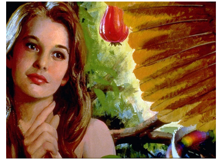
Eve believes the lies of Satan against God and takes the fruit of the tree of knowledge of good and evil.

Revelation 12:4,7,9 His tail drew a third of the stars of heaven and threw them to the earth. And the dragon stood before the woman who was ready to give birth, to devour her Child as soon as it was born....And war broke out in heaven: Michael and his angels fought with the dragon; and the dragon and his angels fought,... So the great dragon was cast out, that serpent of old, called the Devil and Satan, who deceives the whole world; he was cast to the earth, and his angels were cast out with him.