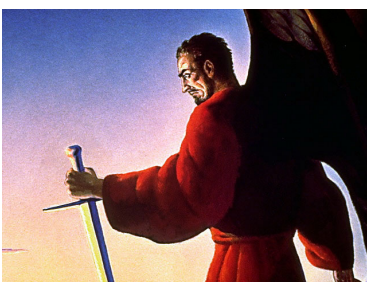
The Devil is like a roaring lion seeking to devour us.

GOD WILL YET DO SOMETHING ABOUT SUFFERING. Those who accept the gospel are given the reward of living in God’s eternal kingdom where sin and suffering will never arise. Soon Satan, sin, sinners and suffering will be gone. The wickedness of sin will have filled its cup of iniquity and will prove beyond doubt to the whole universe that sin and its government must be shunned for eternity. Even Satan will be destroyed. His outcome is eternal death. The lake of fire will bring about his destruction. He will be tormented (i.e. to try, or test) for eternity. Torment does not mean torture. His trial in the fire will result in his eternal end.