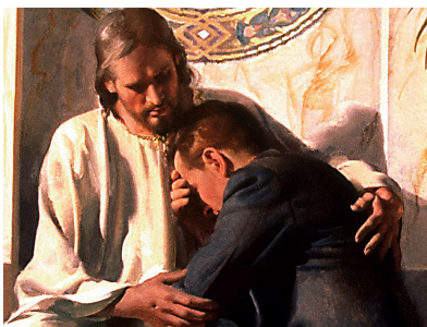
Jesus loves us and will defeat His and our enemy – Satan.

To reverse the procedure would bring defeat. We have nothing to fear while we constantly surrender our lives to Jesus Christ. We need never fear the devil – in fact it is better to think of Jesus.