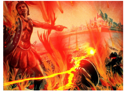
Satan and his followers will be destroyed at the end of the millennium.

2 Corinthians 11:13-15 For such are false apostles, deceitful workers, transforming themselves into apostles of Christ. And no wonder! For Satan himself transforms himself into an angel of light. Therefore it is no great thing if his ministers also transform themselves into ministers of righteousness, whose end will be according to their works.