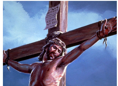
The death of Christ made sure the death of sin and suffering.

The story of Job shows that God is not primarily responsible for suffering. Sometimes God allows suffering for the development of character as was true in the case of Job. Job said, “When He has tested me I shall come forth as gold” (Job 23:10). God did not prevent the suffering of His own Son on the cross. If Jesus had not suffered and died there would be no hope for us to gain everlasting life. Then much suffering is caused by man’s own folly, such as the consequences of war. Suffering is often caused by disobedience to natural laws. Often sickness comes because of a failure to exercise or eat correct food. The basic cause of suffering is sin, because suffering was unknown before sin existed. The devil is the originator of sin, so he is primarily the one to blame – but not God.