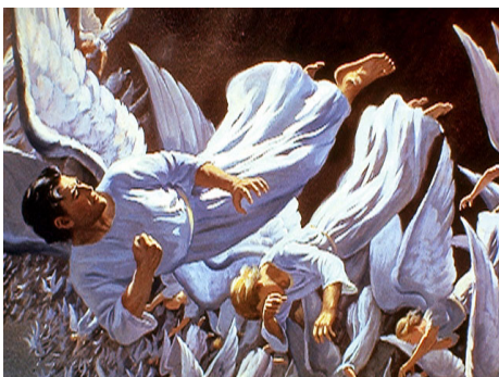
Lucifer and his sympathisers were removed from heaven.

Lucifer was cast out of heaven because of a long succession of selfish choices. He came to live in one narrow dimension: “I”. This is how Lucifer, the Archangel, perfect and sinless, debased himself into Satan, the devil. So selfish had he become that he aspired to take God’s position of rulership. He wanted God’s power, but not His character of love.