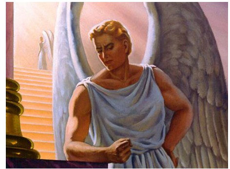
Lucifer in heaven.

God created a perfect being – an angel that excelled in beauty. As it states here “You were perfect in your ways”, but then “iniquity was found in you”. God made a perfect angel, but “Lucifer” (which was his name when God created him) rebelled against God and made a devil of himself. Some will say, “Then is not God responsible?” The answer is “NO”. For example; God made pure grapes, but man allows the juice to ferment and turns it into alcoholic wine. Alcohol robs man of his reason and induces unworthy behavior. Is God to be blamed for the woe caused by alcohol? Of course not! Sin made a devil out of Lucifer. Sin made a race of rebels from perfect humanity. God hates sin and will ultimately eliminate it.