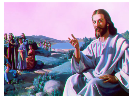
Jesus taught that there was Devil who was the author of sin.

Ezekiel 28:12-15 Son of man, take up a lamentation for the king of Tyre, and say to him, "Thus says the Lord GOD: you were the seal of perfection, full of wisdom and perfect in beauty. You were in Eden, the garden of God; every precious stone was your covering: the sardius, topaz, and diamond, beryl, onyx, and jasper, sapphire, turquoise, and emerald with gold. The workmanship of your timbrels and pipes was prepared for you on the day you were created. You were the anointed cherub who covers; I established you; you were on the holy mountain of God; you walked back and forth in the midst of fiery stones. You were perfect in your ways from the day you were created, till iniquity was found in you."