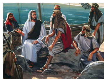
Jesus teaching about Hell.

Jeremiah 17:27 But if you will not heed Me to hallow the Sabbath day, such as not carrying a burden when entering the gates of Jerusalem on the Sabbath day, then I will kindle a fire in its gates, and it shall devour the palaces of Jerusalem, and it shall not be quenched.