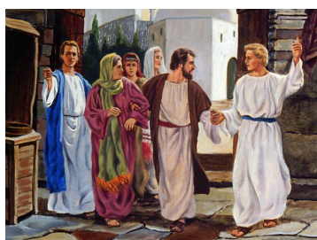
Lot and family escorted out of Sodom.

Sodom and Gomorrah were destroyed by fire many thousands of years ago, yet this text calls the fires of destruction 'eternal fire'. Are these fires burning today? Of course not. Everlasting fire simply means that the fire is eternal in its effects. The everlasting fire at the end of time will destroy the wicked for all time, just as Sodom and Gomorrah were annihilated with never a hope of recovery.