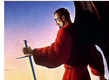
Satan will be burnt to ashes.

Ezekiel 28:18,19 Thou hast defiled thy sanctuaries by the multitude of thine iniquities, by the iniquity of thy traffick; therefore will I bring forth A FIRE FROM THE MIDST OF THEE, it shall devour thee, and I WILL BRING THEE TO ASHES upon the earth in the sight of all them that behold thee. All they that know thee among the people shall be astonished at thee; thou shalt be a terror and NEVER SHALT THOU BE ANYMORE. (KJV)