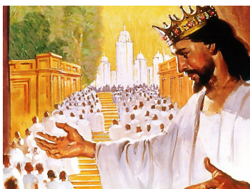
Jesus welcomes saints into heaven.

2 Peter 3:9 The Lord is not slack concerning His promise, as some count slackness, but is longsuffering toward us, not willing that any should perish but that all should come to repentance.