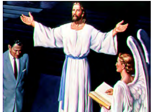
Christ – the God-man interceding for us.

Hebrews 1:5,6 For to which of the angels did He ever say: “You are My Son, Today I have begotten You”? And again: “I will be to Him a Father, And He shall be to Me a Son”? But when He again brings the FIRSTBORN into the world, He says: “Let all the angels of God worship Him.”