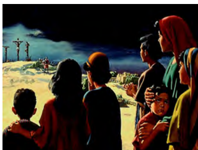
The Holy Spirit points us to Christ and reveals Christ to us.

The Holy Spirit also works toward our salvation.