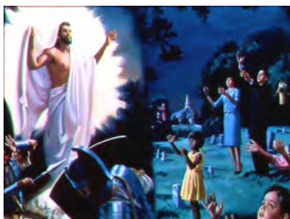
The resurrection of every person depends upon the resurrection of Jesus.

Exodus 4:22 Then you shall say to Pharaoh, Thus says the LORD: “ISRAEL IS MY SON, MY FIRSTBORN.”