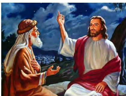
Jesus explaining to Nicodemus about the Holy Spirit.

Ephesians 4:30 And DO NOT GRIEVE THE HOLY SPIRIT OF GOD, by whom you were sealed for the day of redemption.