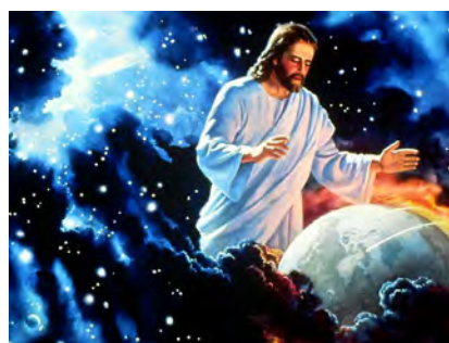
Christ has created all things.

The word firstborn means “first in rank”, and in the context of this chapter shows Christ as responsible for all creation. This places Him as first in rank. Verse 15 does not say He was created by God. Verse 18 gives Him the position of “first in rank” once again in reference to the resurrection. He was not first in “time”, but resurrections were only possible by virtue of Christ’s resurrection; or in this He was “first in rank”.