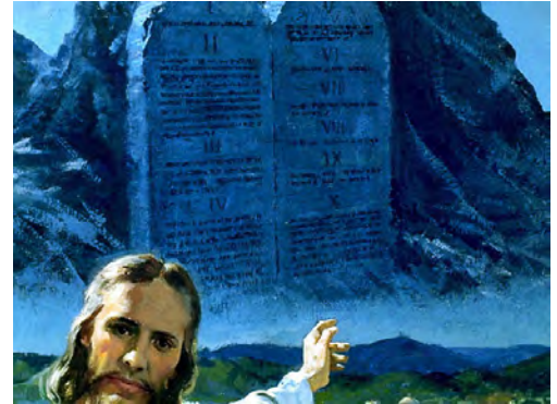
The standard of Judgment – God's Law.

In summary, the earthly sanctuary was a pattern of the heavenly sanctuary. The first apartment entered daily by the priests on earth parallels the first apartment in heaven, where Christ entered after His ascension. The Most Holy Place on earth was entered on the day of judgment, and in heaven Christ entered the Most Holy Place at the commencement of the investigative judgment in fulfilment of the 2,300 day prophecy. The two goats on earth represented: