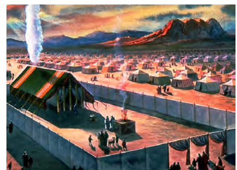
The whole plan of salvation including the judgment was given to Israel in the sanctuary system.

The Sanctuary was built as a central place for sacrifice. God desired to dwell among His people, so the sanctuary was set up, in order that the people could be cleansed of their sins through the shedding of blood, thus enabling God to dwell with them.