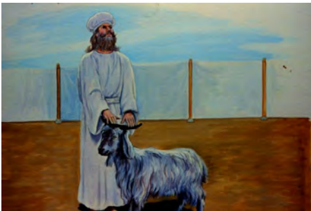
Priest transferring sins to the Azazel goat in the Day of Atonement ritual.

Leviticus 16:7-10 He shall take the TWO GOATS and present them before the LORD at the door of the tabernacle of meeting. Then Aaron shall cast lots for the two goats: one lot for the LORD and the other lot for the scapegoat. And Aaron shall bring the goat on which the LORD’s lot fell, and OFFER IT AS A SIN OFFERING. But the goat on which the lot fell to be the scapegoat shall be presented alive before the LORD, to make atonement upon it, and to let it go as the SCAPEGOAT INTO THE WILDERNESS.