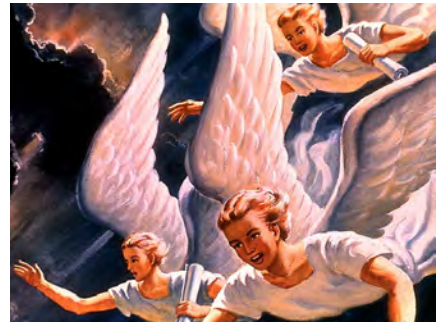
The Three Angels of Revelation 14.

Revelation 14:6,7 Then I saw another angel flying in the midst of heaven, having the EVERLASTING GOSPEL to preach to those who dwell on the earth—to every nation, tribe, tongue, and people—saying with a loud voice, “Fear God and give glory to Him, for THE HOUR OF HIS JUDGMENT HAS COME; and worship Him who made heaven and earth, the sea and springs of water.”