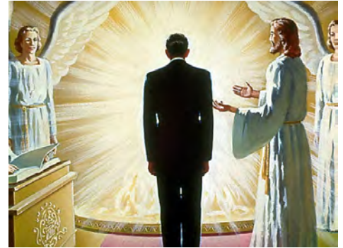
If we have accepted Christ as our Saviour, we are assured of victory in the Judgment.

Hebrews 7:25 Therefore He is also able to save to the uttermost those who come to God through Him, since HE ALWAYS LIVES TO MAKE INTERCESSION FOR THEM.