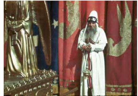
Priest entering the Most Holy Place on the Day of Atonement.

Leviticus 16:29,30 This shall be a statute forever for you: In the seventh month, on the tenth day of the month, YOU SHALL AFFLICT YOUR SOULS, and do no work at all, whether a native of your own country or a stranger who dwells among you. For on that day THE PRIEST SHALL MAKE ATONEMENT FOR YOU, to cleanse you, that you may be clean from all your sins before the LORD.