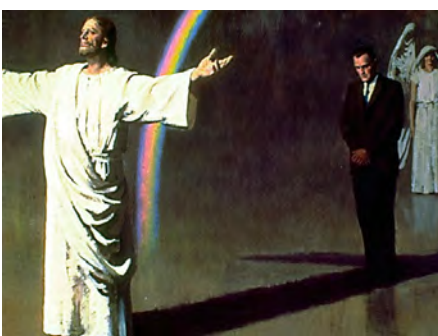
Christ will cover us in the Judgment.

Revelation 3:5 He who overcomes shall be clothed in white garments, and I will not blot out his name from the Book of Life; but I WILL CONFESS HIS NAME BEFORE My FATHER and before His angels.