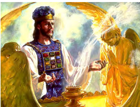
Christ is now in heaven interceding for us while the Judgment takes place.

The judgment began in 1844 is an “investigative judgment”, similar to judgment in court. The “executive judgment”, when sinners are destroyed takes place at the end of the world. This can be paralleled to a man facing the death sentence for his crime. He has been tried, (investigation), found guilty, (declaration or sentence) and put to death (execution or punishment).