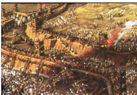
The Destruction of Jerusalem.

The martyrdom of Stephen. A far deeper significance is attached to the stoning of Stephen than may appear to the casual reader. It clinches the former rejection of the Gospel by responsible Jewish leaders at Jerusalem (Acts 7:51-54). It precipitates a new era in Gospel expansion. Exclusive labour for Jews abruptly ceases. Christian witnesses, scattered by the sudden outburst of savage persecution, are impelled to evangelise the Gentiles. Samaritans and the Ethiopian eunuch are the first-fruits from among non-Jews (Acts 8:1,4,5,27,29).