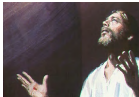
Daniel struggles to fully comprehend the vision but is unable. Before Gabriel finishes the explanation – Daniel faints and the explanation must be continued later in Daniel 9.

Gabriel was unable to continue explanations concerning the vision, because Daniel took sick. All the previous prophecies in the book of Daniel had been explained. The only one left unexplained was the 2,300-day prophecy.