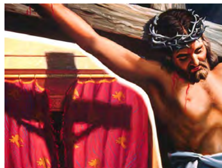
Veil torn when Jesus died.

No longer were animal sacrifices needed. The One great Sacrifice, Jesus, was the One all other sacrifices pointed to. He caused the sacrificial system to cease.