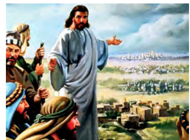
Jesus said in Matt 24:15 that understanding Daniel would be important for the future.

The question is asked, "how long" will the oppression last? How long will the sanctuary and the host be trodden underfoot? and the answer is clear – 2,300 days – then the sanctuary would be cleansed. The word "cleansed" in the margin is "justified", indicating judgment.