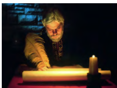
Daniel writes the prophecy.

Daniel 9:24 SEVENTY WEEKS ARE DETERMINED FOR YOUR PEOPLE and for your holy city, to finish the transgression, to make an end of sins, to make reconciliation for iniquity, to bring in everlasting righteousness, to seal up vision and prophecy, and to anoint the Most Holy.