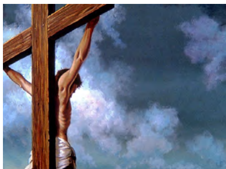
Jesus cut off in the midst of the 70th week.

Daniel 9:26,27 AND AFTER THE SIXTY-TWO WEEKS MESSIAH SHALL BE CUT OFF, but not for Himself; and the people of the prince who is to come shall destroy the city and the sanctuary. The end of it shall be with a flood, and till the end of the war desolations are determined. Then HE SHALL CONFIRM A COVENANT WITH MANY FOR ONE WEEK; but IN THE MIDDLE OF THE WEEK HE SHALL BRING AN END TO SACRIFICE AND OFFERING. And on the wing of abominations shall be one who makes desolate, even until the consummation, which is determined, is poured out on the desolate.