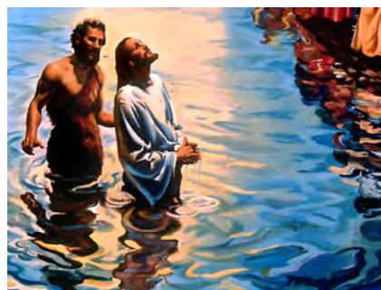
The Baptism of Jesus begins the 70 th week.

The 7 weeks and 62 weeks equal 483 prophetic days or 483 years. This means, counting ahead 483 years from 457 B.C. we are brought to the time of the Messiah, i.e. Jesus Christ. The date comes to 27 A.D.