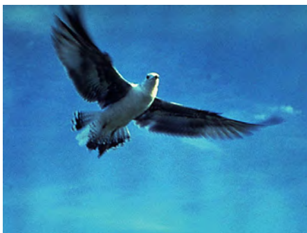
We need the guidance of the Holy Spirit to understand the Bible.

Matthew 7:21 Not everyone who says to Me, 'Lord, Lord,' shall enter the kingdom of heaven, but he who DOES THE WILL OF MY FATHER in heaven.