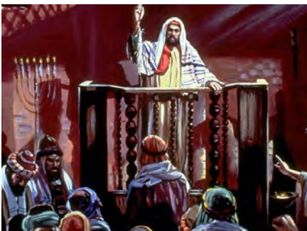
Paul commended the Bereans for searching the Bible every day.

These were more fair-minded than those in Thessalonica, in that they received the word with all readiness, and SEARCHED THE SCRIPTURES DAILY to find out whether these things were so.