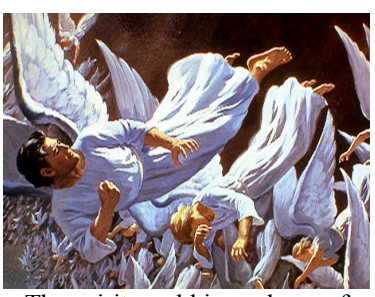
The spirit world is made up of fallen angels expelled from heaven.

Isaiah 14:12-14 HOW YOU ARE FALLEN FROM HEAVEN, O LUCIFER, son of the morning! How you are cut down to the ground, you who weakened the nations! For you have said in your heart: "I will ascend into heaven, I will exalt my throne above the stars of God; I will also sit on the mount of the congregation on the farthest sides of the north; I will ascend above the heights of the clouds, I WILL BE LIKE THE MOST HIGH."