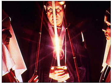
There are a growing number of people who worship Satan.

The variety of spirit world manifestations seems to be endless. There are witches black, white and grey, and warlocks too. Messages are mysteriously written on a blackboard, or typed on a typewriter automatically. There are ghosts, haunted castles and haunted houses. There are crystal ball gazers whose predictions and fulfilments are uncanny. However they are often wrong, which makes us doubt their genuineness, for if God were the source of their inspiration there would be no mistakes. Sometimes it all looks so good, but if the occult looked bad it would never deceive. Those who make counterfeit money try to