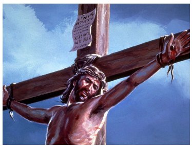
Satan and his angels are defeated by the cross.

On a hill at Calvary almost 2000 years ago, Satan was defeated. Jesus hung upon a cross, nails driven through His hands and feet. His blood was shed and His life was given. It seemed like defeat for the Son of God to die, but in fact His death defeated Satan, because Jesus died for the sins of mankind. My friend, Jesus died for you that day. He died that you might live; that your sins might be forgiven. His death was the only way, but He was prepared to pay the price.