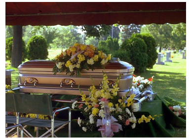
The dead know nothing.

Then there is spiritualism, or contact with the spirit world. In the séance it is claimed one can talk with the dead departed loved ones and friends, and it is true that something appears which can be seen, heard and even felt, resembling exactly those who have died. It is not really the departed dead, but the masquerading of a demon.