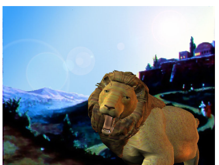
A lion tore and killed the prophet that disobeyed God's word.