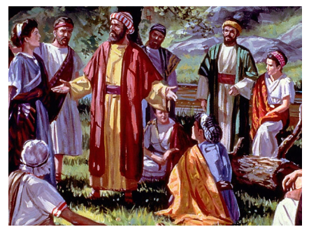
Ananias and Sapphira lied to the Holy Spirit and paid with their lives.

In New Testament times God requires the same kind of obedience as in Old Testament times. This couple had promised God the full price of the land, but when they received such a large amount, they decided to keep some for themselves, keeping it a secret. But secrets cannot be kept