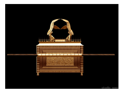
Only the priests were to touch the sanctuary furniture.

2 Samuel 6:3,6,7 So they set the ark of God on a new cart, and brought it out of the house of Abinadab, which was on the hill; and Uzzah and Ahio, the sons of Abinadab,