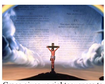
Grace gives us righteousness to keep the law because we can't without it.

Some believe that the Old Covenant was the moral law, or the Ten Commandments, and that when the new covenant was ratified, the law was annulled or set aside. But the Old Covenant was not the 10 commandment law. Instead, it was an agreement made between God and the people. True, the commandments were the basis of the covenant but they were not the covenant. The law was only the subject.