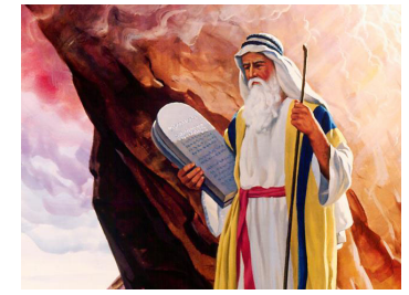
Ten Commandments written on stone.

of Israel." So Moses came and called for the elders of the people, and laid before them all these words which the LORD commanded him. Then all the people answered together and said, "ALL THAT THE LORD HAS SPOKEN WE WILL DO." So Moses brought back the words of the people to the LORD.