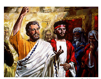
Peter preaching powerfully by the Holy Spirit.

Acts 2:17,18 AND IT SHALL COME TO PASS IN THE LAST DAYS, SAYS GOD, THAT I WILL POUR OUT OF MY SPIRIT ON ALL FLESH; your sons and your daughters shall prophesy, your young men shall see visions, your old men shall dream dreams. And on My menservants and on My maidservants I will pour out My Spirit in those days; and they shall prophesy.