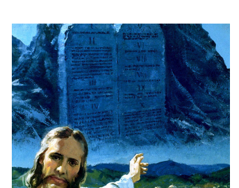
The Holy Spirit is manifested in keeping God's Commandments.

Galatians 5:22,23 BUT THE FRUIT OF THE SPIRIT IS LOVE, JOY, PEACE, LONGSUFFERING, KINDNESS, GOODNESS, FAITHFULNESS, GENTLENESS, SELF-CONTROL. Against such there is no law.