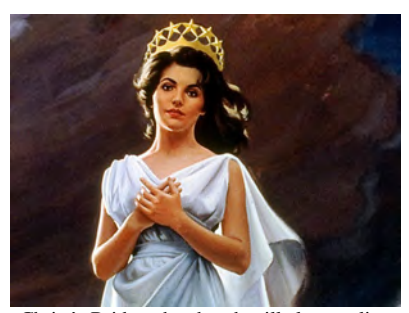
Christ's Bride – the church will always cling to the commandments of God and the faith of Jesus.

world bows down in a reverent obedience to the command of the holy Catholic Church". (Many other quotations could be given by both Protestant and Catholic authors but space does not permit. See "Authoritative Quotations on the Sabbath and Sunday", "From Sabbath to Sunday".)