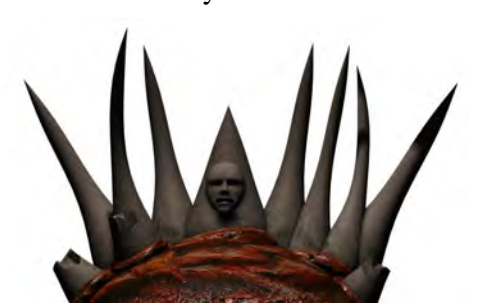
A little horn comes up.

5. Verse 24: "PLUCKED UP THREE". She would