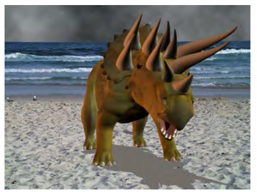
The fourth beast represents Rome.

WAS ANOTHER HORN, A LITTLE ONE, COMING UP AMONG THEM, before whom THREE OF THE FIRST HORNS WERE PLUCKED OUT BY THE ROOTS. And there, in this horn, were eyes like the eyes of a man, and A MOUTH SPEAKING POMPOUS WORDS. Then I wished to know the truth about the fourth beast, which was different from all the others, exceedingly dreadful, with its teeth of iron and its nails of bronze, which devoured, broke in pieces, and trampled the residue with its feet; and the ten horns that were on its