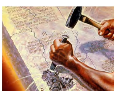
Satan hates God's law.

Here it is plainly shown that seas or waters represent peoples and nations.