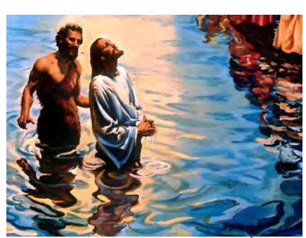
The Baptism of Jesus begins the 70<sup>th</sup> week.

The 7 weeks and 62 weeks equal 483 prophetic days or 483 years. This means, counting ahead 483 years from 457 B.C. we are brought to the time of the Messiah, i.e. Jesus Christ. The date comes to 27 A.D.