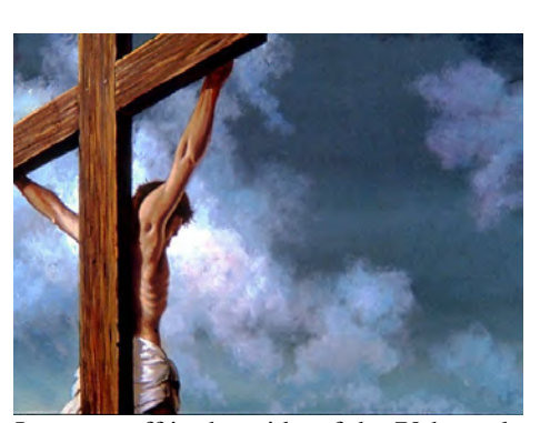
Jesus cut off in the midst of the 70th week.

AND AFTER THE SIXTY-TWO WEEKS MESSIAH SHALL BE CUT OFF, but not for Himself; and the people of the prince who is to come shall destroy the city and the sanctuary. The end of it shall be with a flood, and till