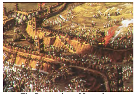
The Destruction of Jerusalem.

The martyrdom of Stephen. A far deeper significance is attached to the stoning of Stephen than may appear to the casual reader. It clinches the former rejection of the Gospel by responsible Jewish leaders at Jerusalem (Acts 7:51-54). It precipitates a new era in Gospel expansion. Exclusive labour for Jews abruptly ceases. Christian witnesses, scattered by the sudden outburst of savage persecution, are impelled to evangelise the Gentiles. Samaritans and the Ethiopian eunuch are the first-fruits from among non-Jews (Acts 8:1,4,5,27,29).