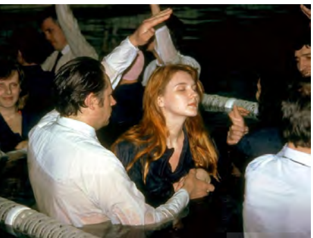
The rite of baptism is symbolic of the death, burial and resurrection of Jesus. We commemorate His resurrection by baptism not worship on Sunday.

By partaking of the symbols of bread and wine in the communion service, we are remembering Christ's death at Calvary. The bread reminds us of His broken body, and the wine of His shed blood to cover our sins. By this service we remember His death.