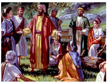
Christians met by a riverside on Sabbath when no synagogue was available.

And from there to Philippi, which is the foremost city of that part of Macedonia, a colony. And we were staying in that city for some days. And