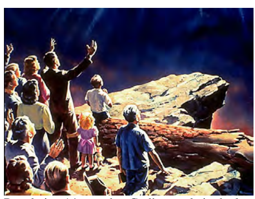
Revelation 14 says that God's people in the last days will keep God's commandments.

The works of His hands are verity and justice; all His precepts are sure. THEY STAND FAST FOREVER AND EVER, and are done in truth and uprightness.