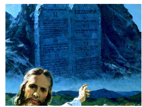
Jesus said – Don't think that I came to destroy the law.

on Calvary's cross, the veil of the great temple curtain was torn from top to bottom, to signify that the entire ceremonial system was forever finished. (See Matthew 27:50,51). No longer need the priests offer up sacrifices. The One great and perfect Sacrifice was offered that Friday afternoon, when the true Passover Lamb bowed His head and died. When He cried out, "It is finished", the old Ceremonial Law that pointed the people to His sacrificial death was nailed to the cross. But NOT SO WITH THE TEN COMMANDMENTS. There was nothing temporary about them. They are to last as long as heaven and earth.