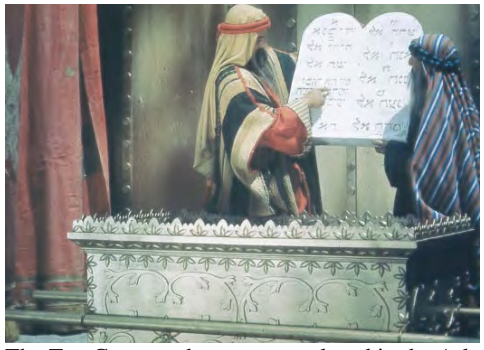
The Ten Commandments were placed in the Ark.

The first four deal with our love to God, and the last six deal with our love for our fellowman. They can be divided into these two sections. There is one underlying principle behind these commands – LOVE. In these commands we see a transcript of God's character: "God is love". At first they may appear to be a list of "don'ts, but when a Christian is motivated by love, he wants to please God and respect his fellowman.