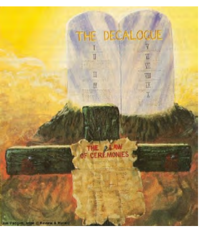
The 10 Commandments stand forever but the ceremonial law was nailed to the cross.

When God led the children of Israel out of Egyptian bondage, He delivered to them in fiery majesty the Ten Commandments. This holy law was spoken by God, written by God, recorded on tables of stone, and is of eternal duration. At the same time another law, of temporary usage, was also delivered to the children of Israel. This law dealt with the ceremonial rites of the Jewish sanctuary service, and concerned itself with a system of religion that passed away at the cross. Large sections of Exodus, Leviticus, Numbers and Deuteronomy describe in detail this temporary ceremonial code. This Law can easily be identified in the Scriptures. It talks about circumcision (a religious Jewish rite), sacrifices, offerings, purifications, ceremonial holy days, and other rites associated with the Hebrew sanctuary service.