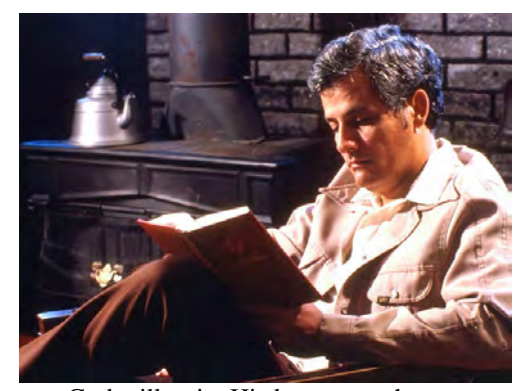
God will write His law on our hearts.

And having been perfected, He became the author of eternal salvation TO ALL WHO OBEY HIM.