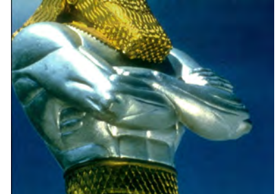
The Silver Chest of Medo-Persia.

But after you shall arise ANOTHER KINGDOM inferior to yours; then ANOTHER, A THIRD KINGDOM OF BRONZE, which shall rule over all the earth.