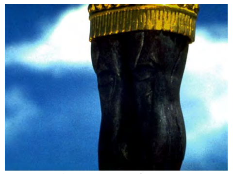
The Iron Legs of Rome.

Here we see a divided Europe after the downfall of Rome. The prophecy states it will be partly strong and partly broken. This has been accurately fulfilled, as down through the history of Europe there have always been some nations strong, while others have been weak. The Roman Empire had been