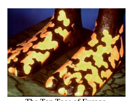
The Ten Toes of Europe.