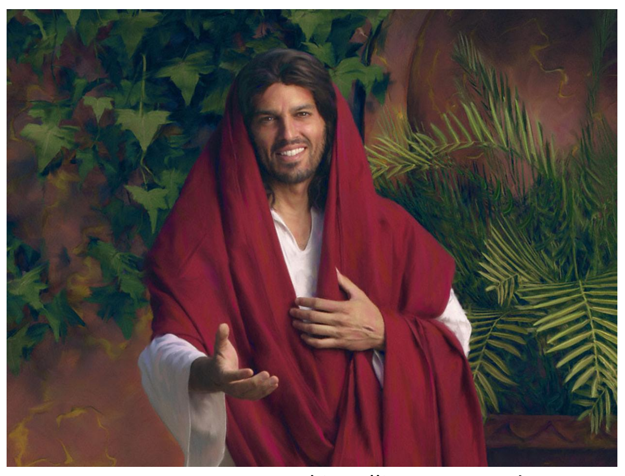
Jesus Loves you and is calling you now!

Question 08: Do you want to be ready to meet Jesus as your Friend when He comes again very soon?