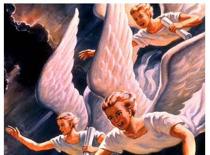
God is calling people out of false systems of worship to unite with God's remnant church

Revelation 18:2, 4 And he cried mightily with a loud voice, saying, "Babylon the great is fallen, is fallen, and has become a dwelling place of demons, a prison for every foul spirit, and a cage for every unclean and hated bird!" And I heard another voice from heaven saying, "Come out of her, my people, lest you share in her sins, and lest you receive of her plagues."