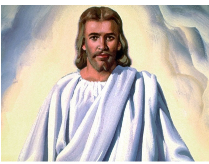
Christ is the foundation of the Church.

Ephesians 2:20 Having been built on the foundation of the apostles and prophets, Jesus Christ Himself being the chief corner stone .