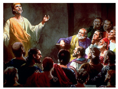
Elders were appointed in every church.

The church is composed of those who respond to the call of Christ and find salvation. It was God's plan to have His people in an organised band, which He called – "the church".