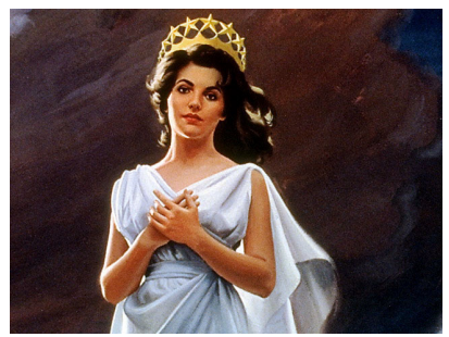
Church depicted as a women in Revelation 12.

As we approach the end of time it becomes more important to assemble together. We need the strength gained by fellowship to live victorious Christian lives. It is God's desire that we attend the