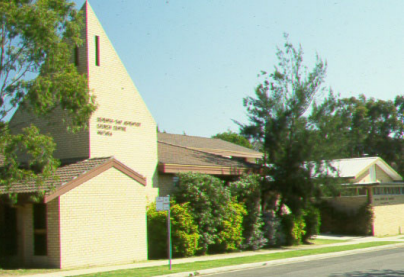
The church has the responsibility of dealing with sin in the church.

Christ loves the church supremely. It is composed of His special treasure - those who have responded to His love and have accepted Him as their Saviour. A church building may be necessary, but the real church is composed of people – born again Christians. While we trust in Him and His righteousness. He can look upon His church as having no spot or wrinkle.