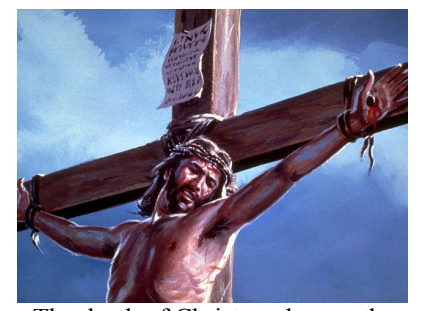
The death of Christ made sure the death of sin and suffering.

For God so loved the world that He gave His only begotten Son, that whoever believes in Him should not perish but have everlasting life.