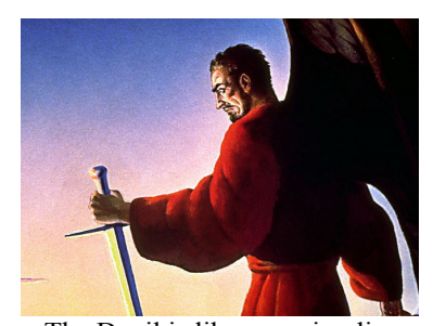
The Devil is like a roaring lion seeking to devour us.

GOD WILL YET DO SOMETHING ABOUT SUFFERING. Those who accept the gospel are given the reward of living in God's eternal kingdom where sin and suffering will never arise. Soon Satan, sin, sinners and suffering will be gone. The wickedness of sin will have filled its cup of iniquity and will prove beyond doubt to the whole universe that sin and its government must be shunned for eternity. Even Satan will be destroyed. His outcome is eternal death. The lake of fire will bring about his destruction. He will be tormented (i.e. to try, or test) for eternity. Torment does not mean torture. His trial in the fire will result in his eternal end.