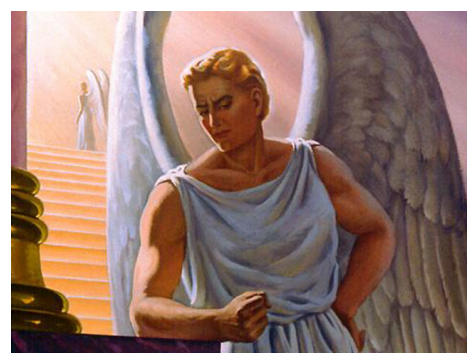
Lucifer in heaven.

God created a perfect being – an angel that excelled in beauty. As it states here "You were perfect in your ways", but then "iniquity was found in you". God made a perfect angel, but "Lucifer" (which was his name when God created him) rebelled against God and made a devil of himself. Some will say, "Then is not God responsible?" The answer is "NO". For example; God made pure grapes, but man allows the juice to ferment and turns it into alcoholic wine. Alcohol robs man of his reason and induces unworthy behavior. Is God to be blamed for the woe caused by alcohol? Of course not! Sin made a devil out of Lucifer. Sin made