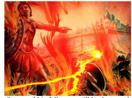
Satan and his followers will be destroyed at the end of the millennium.

2 Corinthians 11:13-15 For such are false apostles, deceitful workers, transforming themselves into apostles of Christ. And no wonder! For Satan himself