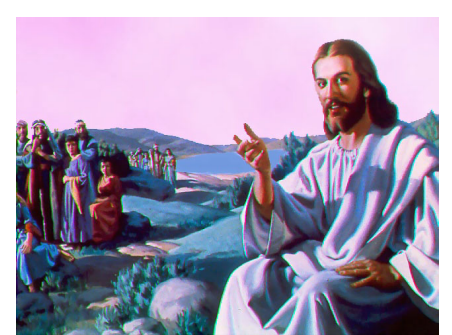
Jesus taught that there was Devil who was the author of sin.

Ezekiel 28:12-15 Son of man, take up a lamentation for the king of Tyre, and say to him, "Thus says the Lord GoD: you were the seal of perfection, full of wisdom and perfect in beauty. You were in Eden, the garden of God; every precious stone was your covering: the sardius, topaz, and diamond, beryl, onyx, and jasper, sapphire, turquoise, and emerald with gold. The workmanship of your timbrels and pipes was prepared for you on the day you were created. You were the anointed cherub who