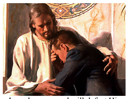
Jesus loves us and will defeat His and our enemy – Satan.

To reverse the procedure would bring defeat. We have nothing to fear while we constantly surrender our lives to Jesus Christ. We need never fear the devil – in fact it is better to think of Jesus.