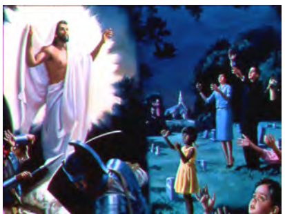
The resurrection of every person depends upon the resurrection of Jesus.

Exodus 4:22 Then you shall say to Pharaoh, Thus says the LORD: "ISRAEL IS MY SON, MY FIRSTBORN."