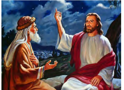
Jesus explaining to Nicodemus about the Holy Spirit.

And DO NOT GRIEVE THE HOLY SPIRIT OF GOD, by whom you were sealed for the day of redemption.