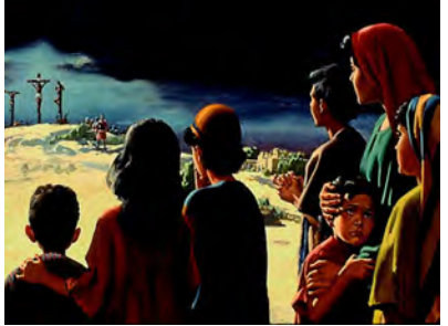
The Holy Spirit points us to Christ and reveals Christ to us.

The Holy Spirit also works toward our salvation.