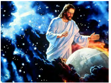
Christ has created all things.

The word firstborn means "first in rank", and in the context of this chapter shows Christ as responsible for all creation. This places Him as first in rank. Verse 15 does not say He was created by God. Verse 18 gives Him the position of "first in rank" once again in reference to the resurrection. He was not first in "time", but resurrections were only possible by virtue of Christ's resurrection; or in this He was "first in rank".