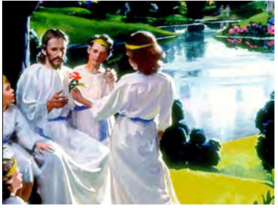
What a wonderful place it will be.

Revelation 22:14,15 Blessed are THOSE WHO DO HIS COMMANDMENTS, that they may HAVE THE RIGHT TO THE TREE OF LIFE, and may enter through the gates into the city. But outside are dogs and sorcerers and sexually immoral and murderers and idolaters, and whoever loves and practices a lie.