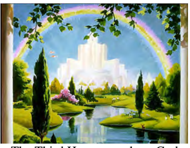
The Third Heaven – where God dwells.

For he WAITED FOR THE CITY which has foundations, WHOSE BUILDER Hebrew 11:10,16