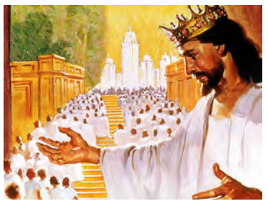
We shall see His face.

They SHALL SEE HIS FACE, and His name shall be on their foreheads.