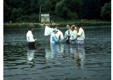
The gospel preached in all the world.

On November 13, 1833 the greatest meteoric shower ever seen occurred. More than 200,000 “shooting stars” fell each hour for six hours. Many had read that the stars would fall, and they were convinced the end of the world had come, and prayed in the streets. These events did not mark the end of time, but were signs that the world had entered into the period of time known as the “time of the end”. These happenings marked the “beginning of the end”.