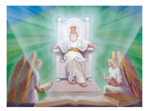
Ans: d. The one sitting on the throne mentioned in this verse is God the ___

I was in the spirit. The term in the spirit is a Bible term for being in vision or under the direction of the Holy Spirit Ezek 37:1; Mt 22:43; Lk 4:1; Rom 8:9; Rev 17:3; 21:10. Therefore John is having his second vision which has the same purpose as the first vision of the Seven Churches. The purpose is to show the things which must be hereafter Rev 1:19; 4:1.